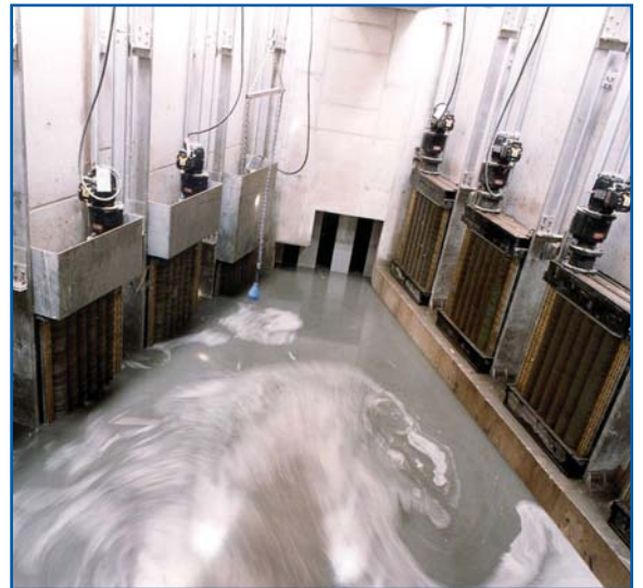
Installation of nine Discreens and two Munchers, together with a guide rail system for easy removal from the 7 metre deep storm chamber

Mono is approved by all Water Plc's and major Civil Contractors, along with many 'Blue Chip' manufacturing companies.