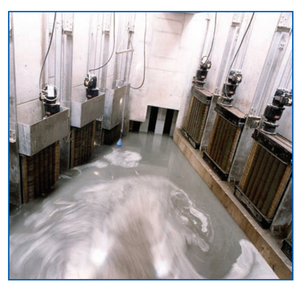
Installation of nine Discreens and two Munchers, together with a guide rail system for easy removal from the 7 metre deep storm chamber

Mono is approved by all Water Plc's and major Civil Contractors, along with many 'Blue Chip' manufacturing companies.