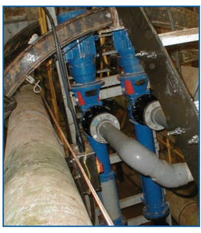
Vertical pumps installed in a 47m deep tunnel

Installations at industrial plants have included £100,000 mechanical and electrical installation for groundwater pumps; heavy duty vertical pumps with 250kg swing jib and fully automated tanker loading pumping systems.