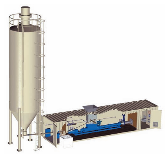
A packaged sludge treatment plant designed by Mono