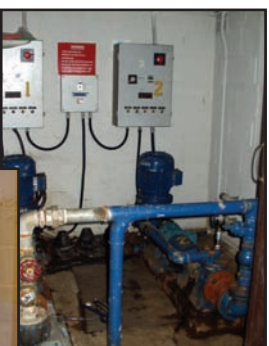
Refurbishment of an old pump station, complete with new interconnecting pipework and control panels