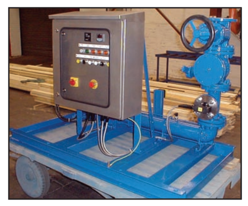
Skid mounted package comprising pump, gearbox, control panel, baseplate and suction and delivery pipework connections

To meet the requirements of your installation, bespoke packages can be supplied. These are designed on the 'Plug and Play' principle, normally requiring only final pipe and electrical connections to be made on site, helping to reduce installation costs.