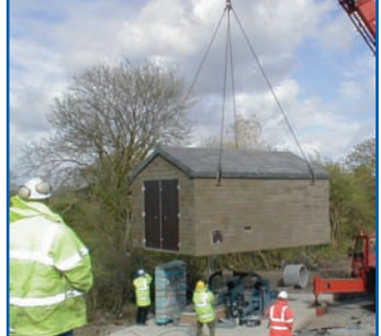
The management of craneage for a contract to install a special acoustic GRP kiosk and sewage pumps